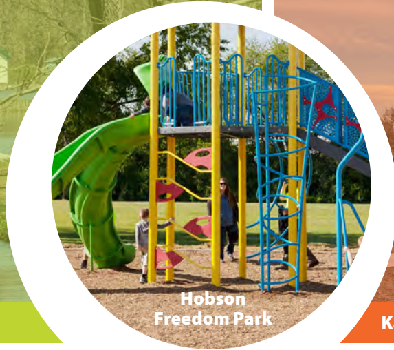
Hobson Freedom Park