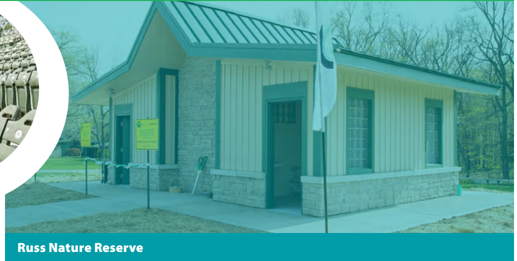
Russ Nature Reserve