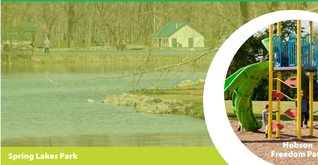
Spring Lakes Park