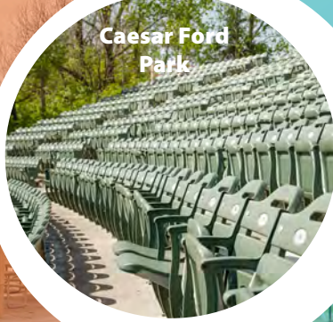
Caesar Ford Park