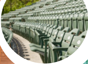
Caesar Ford Park