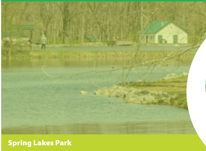
Spring Lakes Park