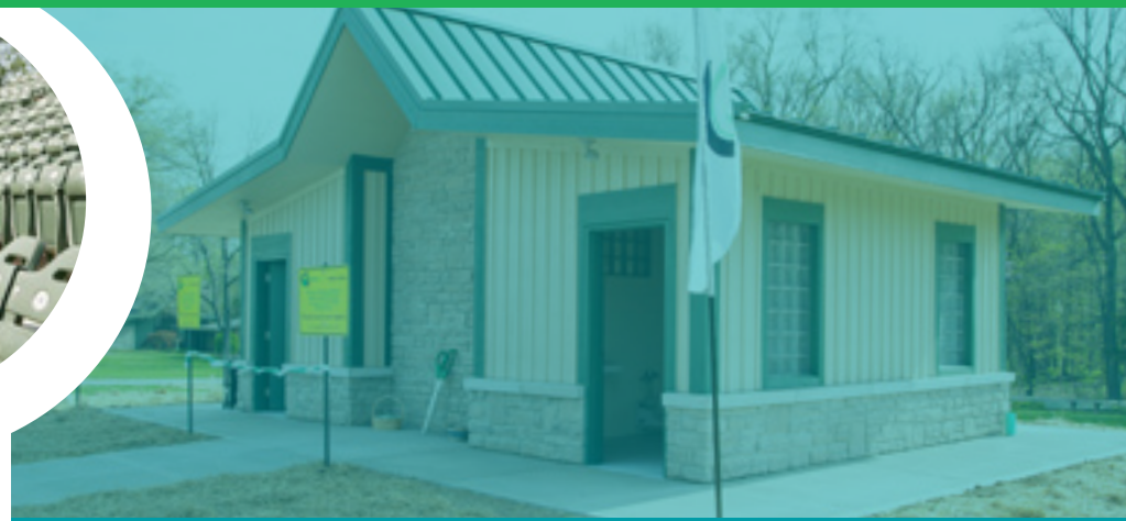
Russ Nature Reserve