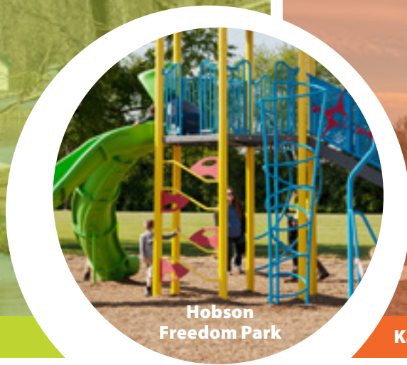
Hobson Freedom Park